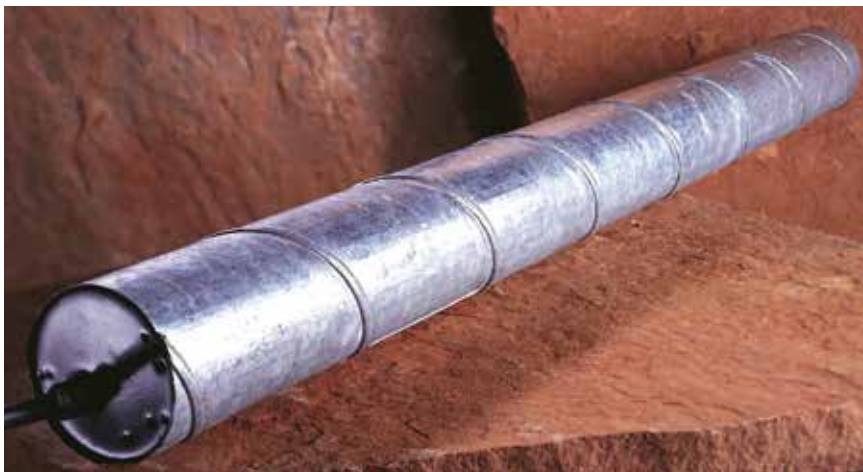
< LIDA® Pack Canistered Wire Anode

To allow moisture to quickly migrate to the coke backfill for increased electrical conductivity, the wire anode element is electrically connected to the steel canister — thereby accelerating the canister corrosion rate once the anode has been installed and energized. Specify cable lengths and type when placing any order.